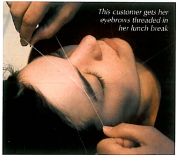
This customer gets her eyebrows threaded in her lunch break

"I've chosen only high-grade products for my salon, for example, we use hypo-allergenic, Perron Rigot hot wax which sticks to the hair not to the skin, without fabric strips, so there is less breakage. After-care is important too, so we use a blend of cooling and soothing gel and essential oils for the skin, but probably most importantly, our therapists are specialists at what they do." Which I would undoubtedly agree with as, during my visit, I watch a couple of treatments taking place - it's time to bust some myths. Waxing or threading, in the hands of an expert, doesn't really hurt. It's a fleeting 'pinch' and any redness afterwards, when carefully managed, soon disappears. The result is lasting, silky smooth skin -